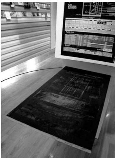
Print/plate setup, exhibition seal & slide projector stand

In 2008, the year of Palladio's 500th anniversary, A+M had considered collecting their nearly-Palladian experience into a visual treatise form. Taking clues from Palladio's own Quattro Libri in separation of content (Book I – architectural orders, wall types, details, site selection; Book II – private residences & housing; Book III – bridges, fountains, site planning, miscellaneous typologies; Book IV – places of public assembly) and presentation technique (wood cut – the most common way of disseminating drawings in Palladio's times, but produced from plywood blocks laser-engraved with AutoCAD drawings – thus also using the most common commercial architecture tools of today), emerged The Four Books of Archiculture, Discovering Palladio in Central PA and Beyond .